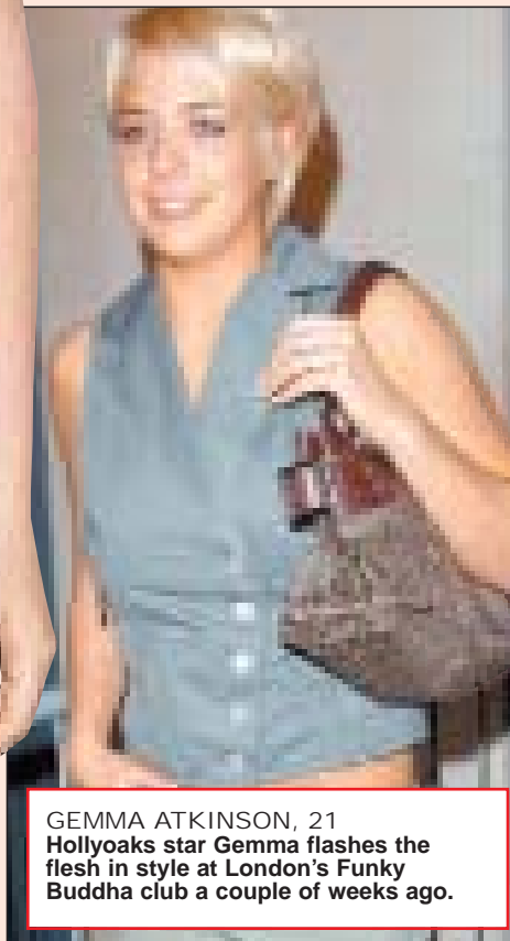
GEMMA ATKINSON, 21 Hollyoaks star Gemma flashes the flesh in style at London's Funky Buddha club a couple of weeks ago.