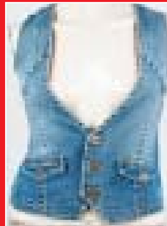
CLASSIC: Blue denim, £21, by Additions Direct (0870 413 5000)