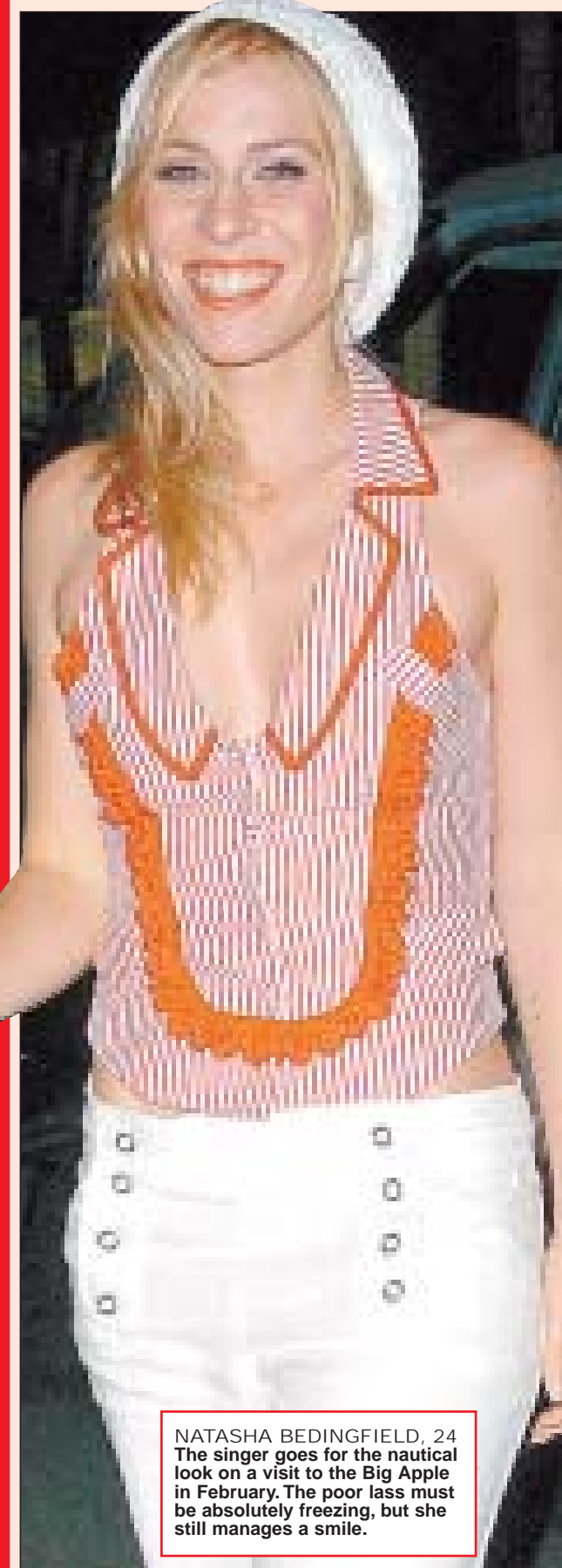
NATASHA BEDINGFIELD, 24 The singer goes for the nautical look on a visit to the Big Apple in February. The poor lass must be absolutely freezing, but she still manages a smile.

HANG on to your old waistcoats, girls - they're set to be this season's must-have.