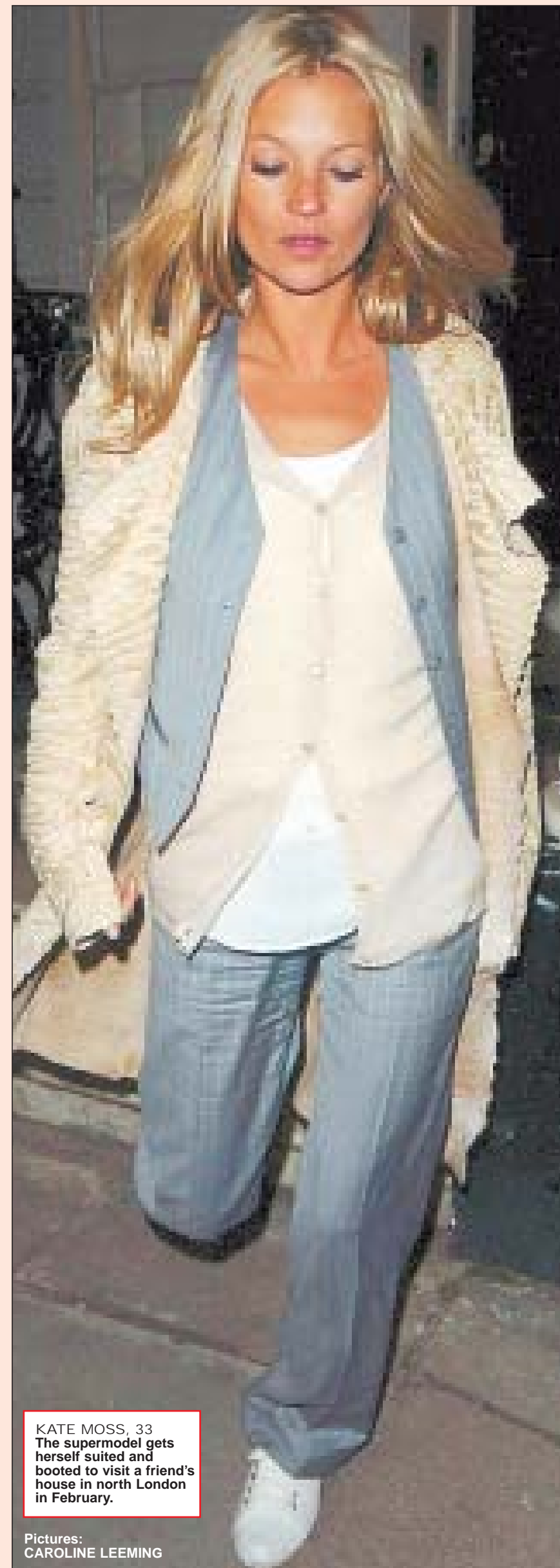
KATE MOSS, 33 The supermodel gets herself suited and booted to visit a friend's house in north London in February.