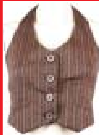
BARGAIN: Striped style, £12, from Peacocks (0115 965 8800)