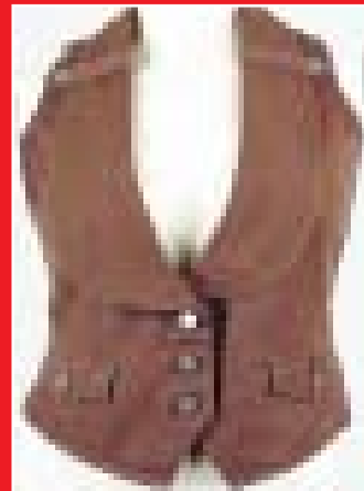
CLASSY: Brown waistcoat, £25, by Additions Direct (as before)