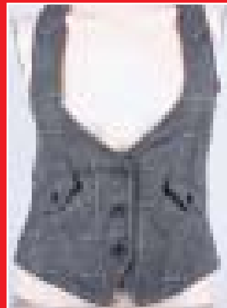
CHECK THIS: At £35, by Vila at House of Fraser (0870 160 7270)