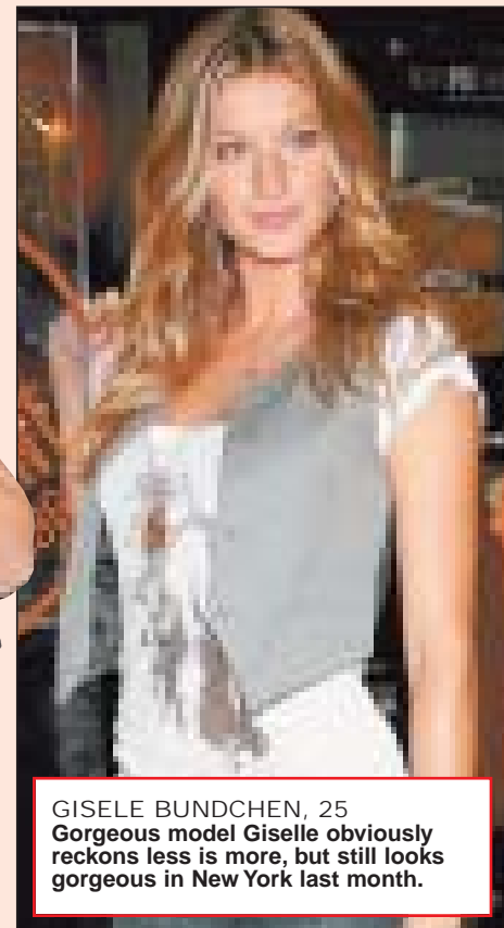
GISELE BÜNDCHEN, 25 Gorgeous model Giselle obviously reckons less is more, but still looks gorgeous in New York last month.