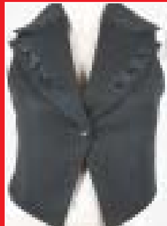
CITY CHIC: Pinstripe, £32, by Stark at USC (0800 731 6912)